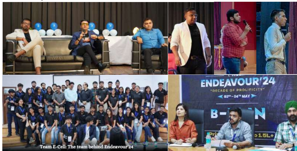
Team E-Cell: The team behind Endeavour'24

KIET's 10 th annual E-Summit, ' Endeavour'24: Decade of Prolificity ,' was organized by the E-Cell on May 3 and 4, 2024.