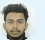
3. Akshay Kumar