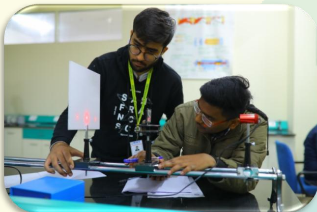
Engg. Physics Lab