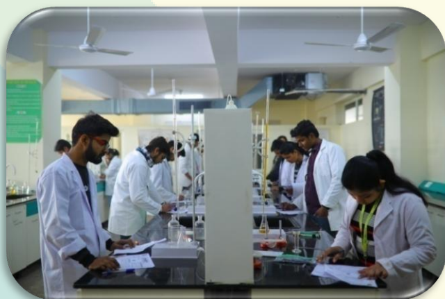
Engg. Chemistry Lab