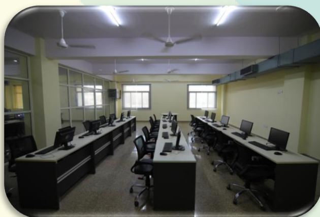
Professional Comm. Lab